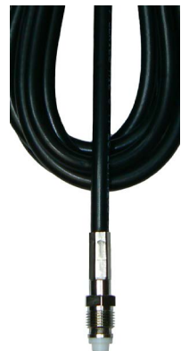
FME female fitted to cable as standard or specify requirements