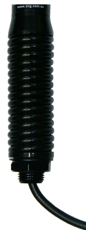
Light to medium-duty parallel spring to maintain vertical polarisation