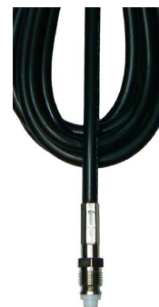
FME female fitted to cable as standard for ease of installation